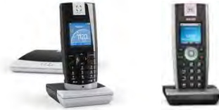
snom m3 / m9 IP DECT Phone