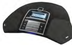
snom Meeting Point IP Conference Phone