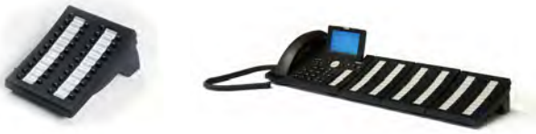
snom Expansion Module