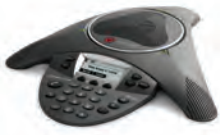
Polycom SoundStation IP Conference Phone